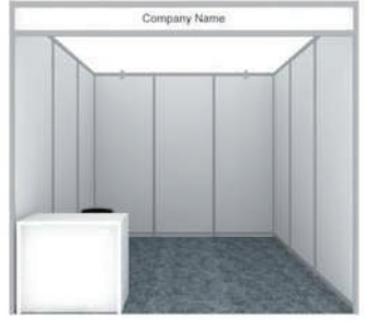
[ Shell Scheme Type ]